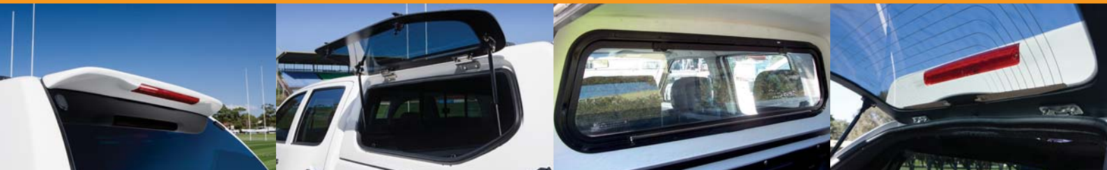
DEFLECTOR WITH LIGHT (STANDARD)