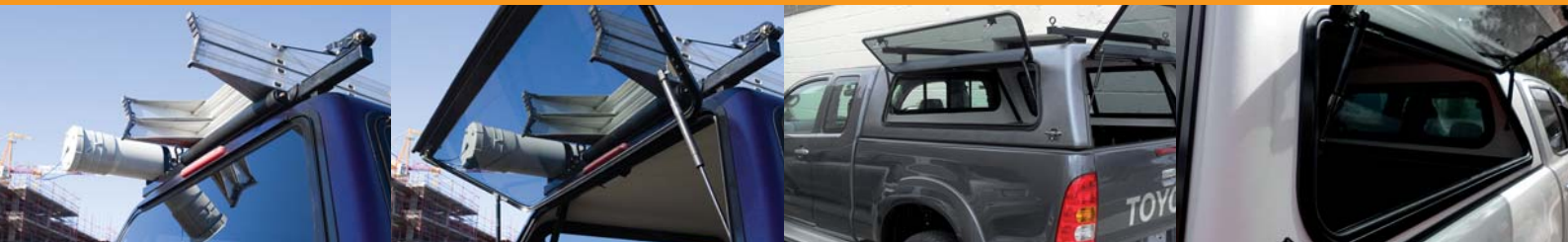
LARGE ACCESS DOOR (STANDARD)

AVAILABLE IN DUAL CAB, EXTRA CAB (PICTURED ABOVE) AND SINGLE CAB MODELS