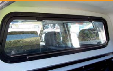
DROP DOWN FRONT WINDOW (STANDARD)