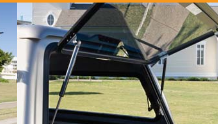
LARGE ACCESS DOOR (STANDARD)

The Flexiglass Premier is the first fiberglass smooth finish canopy to be manufactured in Australia.