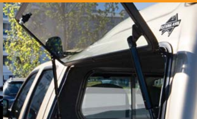
COMMON SIDE LIFT UP WINDOORS (OPTIONAL)